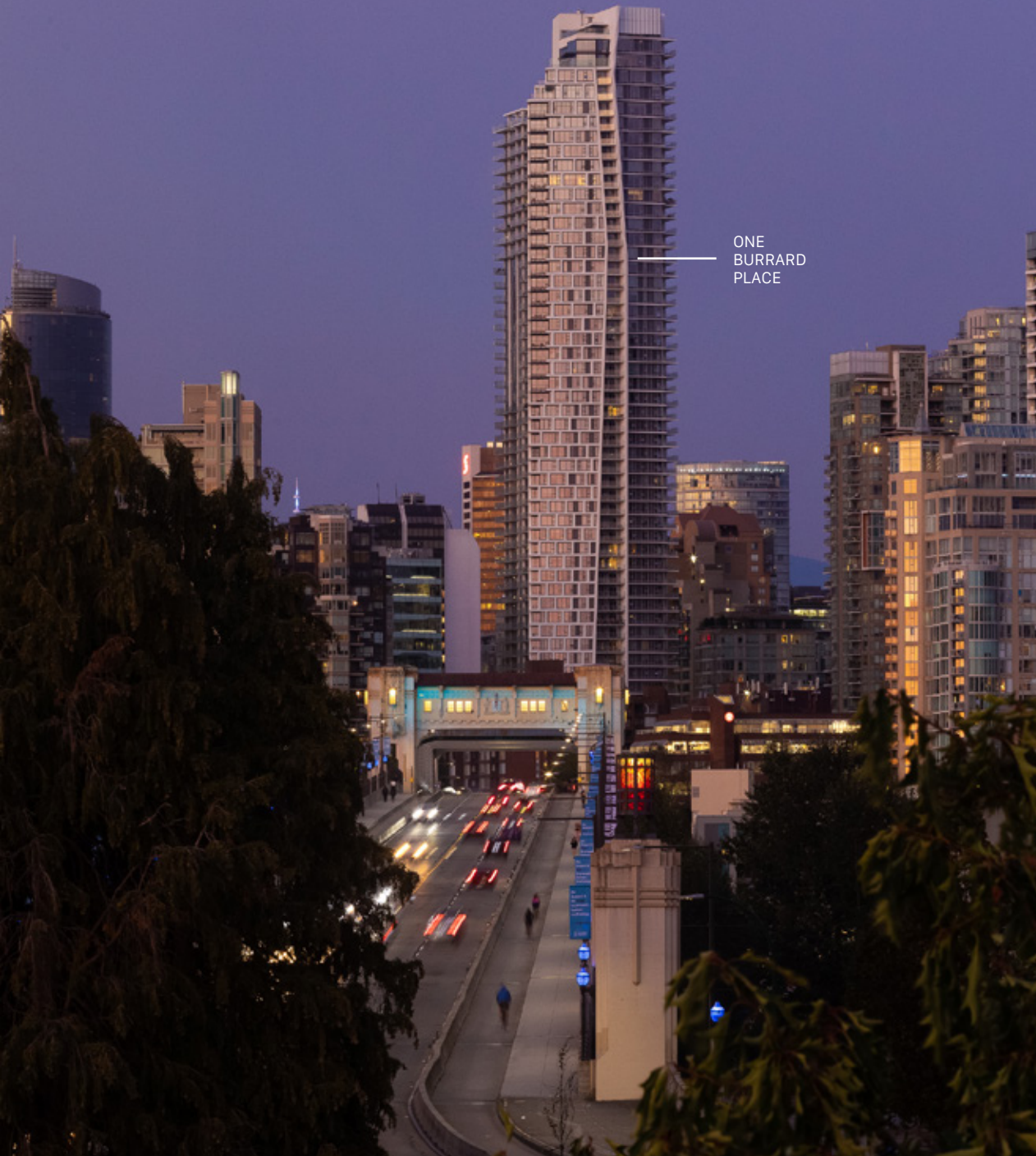
ONE BURRARD PLACE