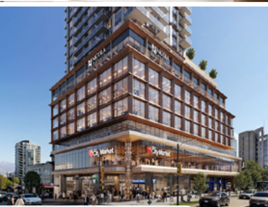
The Stories by PCI Development