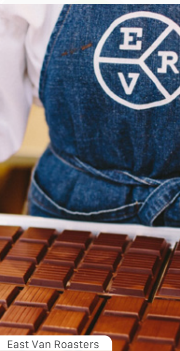
East Van Roasters