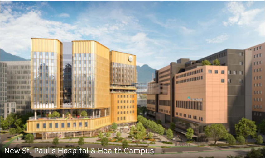
New St. Paul's Hospital & Health Campus