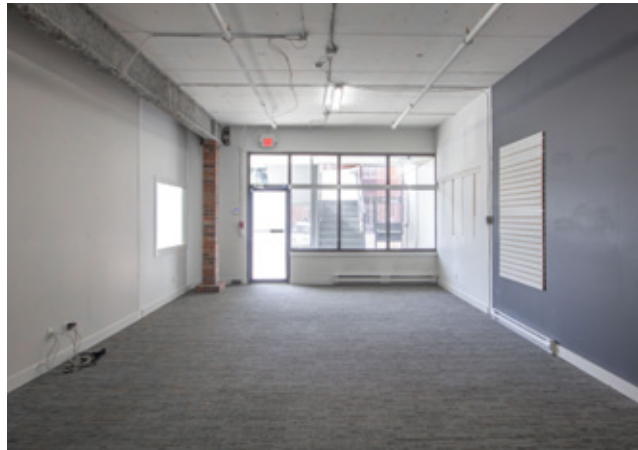
Parking & Loading at Rear