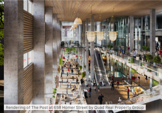
Rendering of The Post at 658 Homer Street by Quad Real Property Group